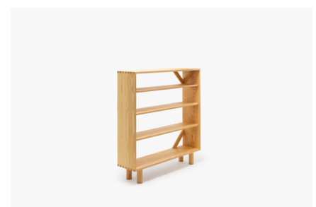
Crate Shelf No.2