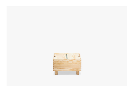
Crate Series No.1