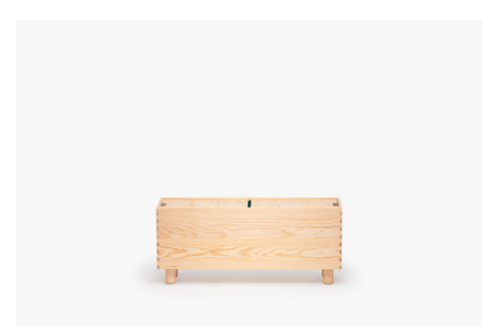
Crate Series No.2