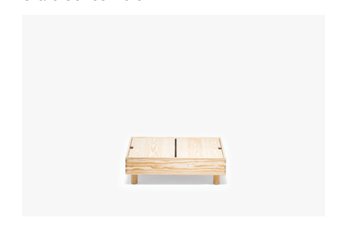
Crate Series No.3