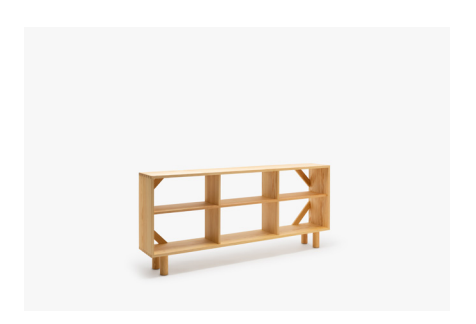
Crate Shelf No.1